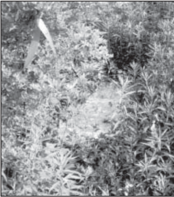
Figure 2. A large coverboard at a sampling point in a foliage-spray unit (photo taken by RHY in June 1999).

zones, border zones, and adjacent forest. In 1999, rocks and logs were overturned to check for amphibians and reptiles for comparison to data collected beneath coverboards. However, rocks and logs were very scarce along the ROW and adjacent forest, and no amphibians or reptiles were found under rocks or logs (Yahner et al. 1999a).