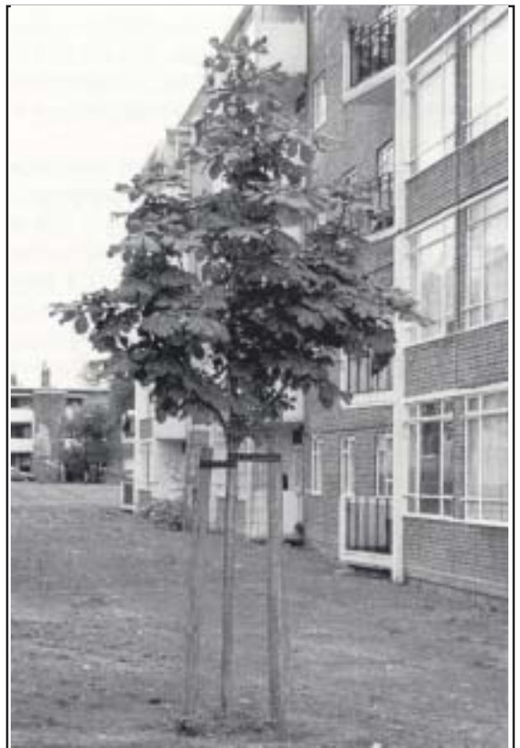
Figure 1. Tree supported with 2 stakes and protected with a wire mesh cage.

to either rule out or encourage the possibilities for tree planting. A decision was made to apply the same available funds as previous years to purchasing 16% of the quantity of the previous year but of larger, higher quality trees. Two hundred containerized advanced nursery stock (ANS) 16- to 18-cm girth (4-in. caliper) trees were selected specific to the identified site but based on nursery stock availability lists and historical success rates. To this end, species included Crataegus monogyna , Sorbus aria , and S. ∞ intermedia , Platanus acerifolia , Fraxinus oxycarpa 'Raywood' and F. excelsior 'Jaspidea', Acer pseudoplatanus 'Leopoldii', and Aesculus hippocastanum 'Baumanni'. It was also decided to protect each tree with a weld-mesh galvanized guard supported by 2 diametrically opposed pressure-treated round wood stakes (Figure 1). To avoid accumulation of litter in the guard, a gap of about 200 mm (8 in.) was left between the bottom of the guard and ground level. Each tree was supported by rubber-sleeved strapping at