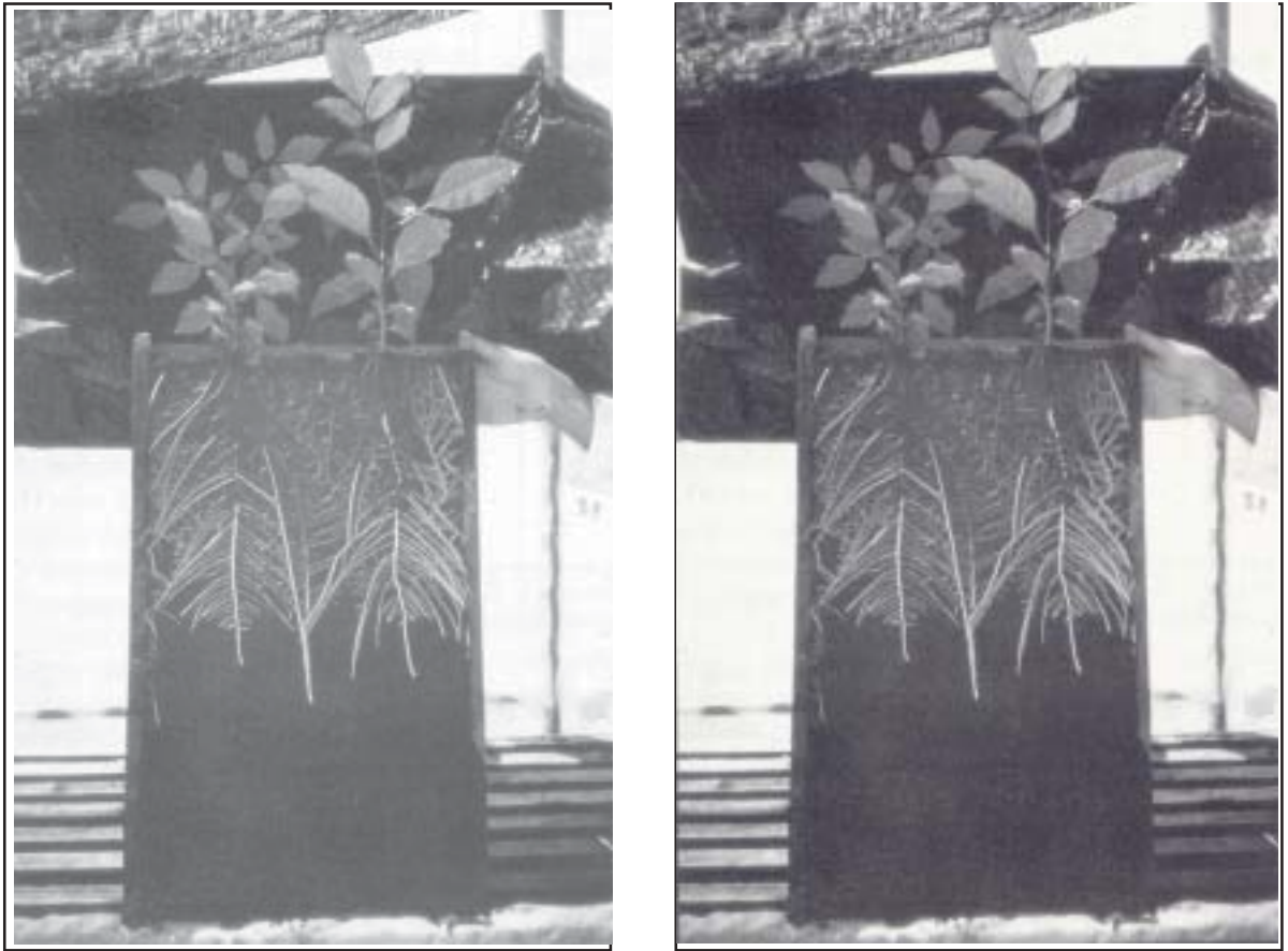
Figure 1. Fraxinus uhdei root system growing in the coarse-textured (left) and fine-textured (right) soil rhizotrons after 162 days, before the soil was washed away.

(Figure 2). Fraxinus uhdei roots growing in coarse-textured soil were not visible behind the glass until day 42 and were more shallow when they became visible.