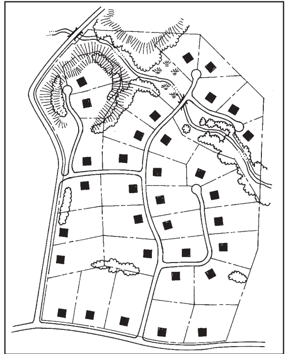
Figure 2. Traditional subdivision design provides for the maximum number of minimum-sized lots.

Much scientific bantering has occurred over what ecosystems are, whether boundaries can be placed around them, and how data collection, monitoring, modeling, and other operationalizing aspects can take place. Ecosystem planning processes are criticized for placing the nonhuman biological and physical attributes of nature ahead of goals for human advancement. As a process that seeks to under-