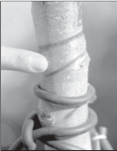
Figure 4. Injury to tree stem by Tree Saver Tree Anchoring straps. Stems of soft-wooded species might be girdled and perhaps affected in their growth when exposed to windy conditions, such as these were.

from northeast, northwest, southwest, east, and southeast directions. Therefore, the deflection of stems by wind was 2-directional, which may have affected not only growth in height and stem diameter, but also stem taper. The degree of stem deflection by wind depended on wind speed, resistance of the stem supports, and the season. The experimental site was visited more than 90 times when high winds were forecast, to observe the performance of supports when crowns and stems swayed in the wind. Lateral movement of crowns and stems during the growing season began when the wind speed reached approximately 2.5 m/sec [8 ft], and such wind speeds developed in 68 days (Figure 5). In contrast, wind speeds of the same velocity barely moved the crowns and stems of leafless trees.