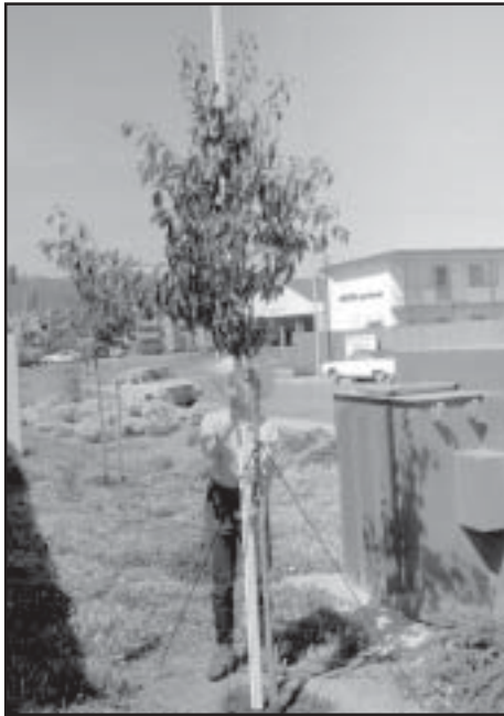
Figure 3. Height measurement with Pentax stick of Pyrus calleryana supported with the Tree Saver Tree Anchoring System (TS).

(cm) divided by the distance between the 2 measurements (in cm), and multiplying by 10 to convert to mm/cm.