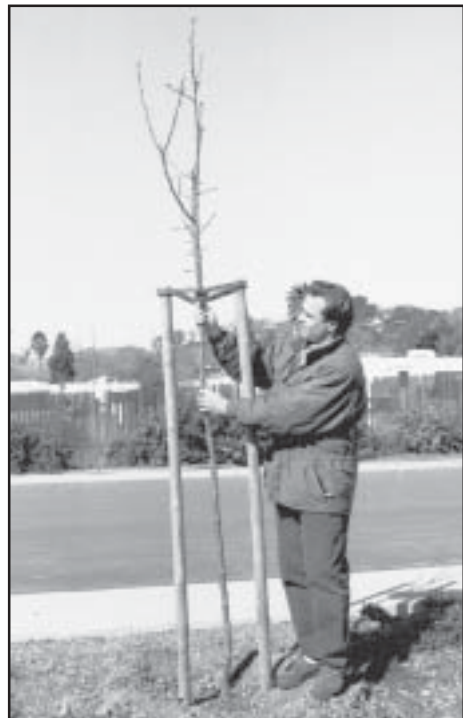
Figure 1. Double-stake (DS) support system.

This paper compares the effects of a commonly used double-stake stem support system with 2 new designs, Bio-Tie (Vitech Technologies, Inc.) and Tree Saver™ (Lawson & Lawson, Inc.), on the growth of Pyrus calleryana after replanting from 57-L (15-gal) containers into California landscape conditions. Because these trees were unable to stand upright without the stake support, the objective of this study was to evaluate the effect of these methods on shoot and caliper growth.