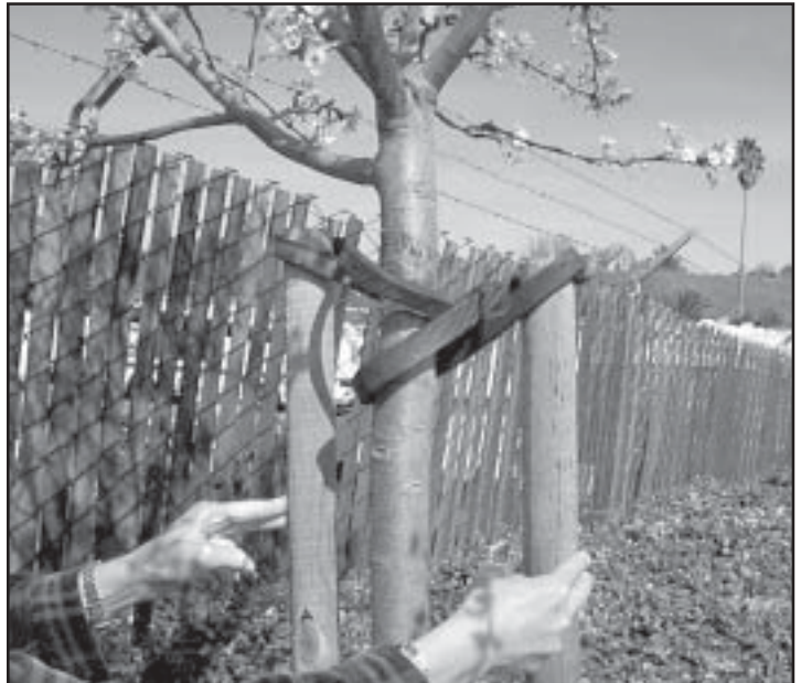
Figure 6. Slight lateral pressure with fingers moved (bent) stakes more than 15 cm (6 in.) after 1 year of continuous stem and crown movement by wind. This photograph demonstrates that even “rigid” double stakes stiffened with 2 ties to the stem could only partially oppose sideways stem deflection after 1 year.