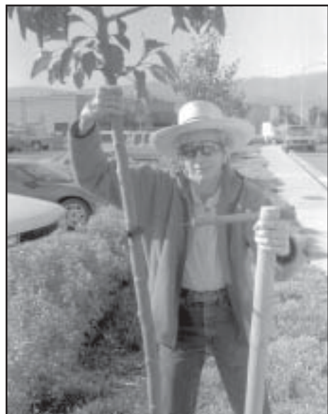
Figure 2. Bio-Tie (BT) support provided freedom for stems to sway in the wind.

Over a 3-year period (February 10, 1994, to February 13, 1997) a Pentax stick was used to measure tree height and height to the first lateral branch; stem diameter was measured at 3 stem locations: 30 cm (1 ft) above the ground (bottom diameter), 30 cm below the lowest lateral branch (top diameter), and midway between (center diameter). Stem diameter measurements were made with a microcaliper at 2 right-angle directions. Mean diameters were calculated for the 3 stem positions. Stem taper was calculated by subtracting the top diameter (cm) from the bottom diameter