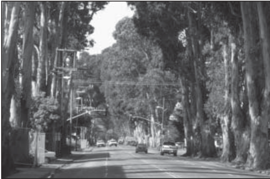
Figure 1. Sixteen Tasmanian blue gum ( Eucalyptus globulus Labill.) and 5 Scotch elm ( Ulmus glabra Huds.) were evaluated for decay in Burlingame, California. Trees were removed and sectioned following decay assessments.