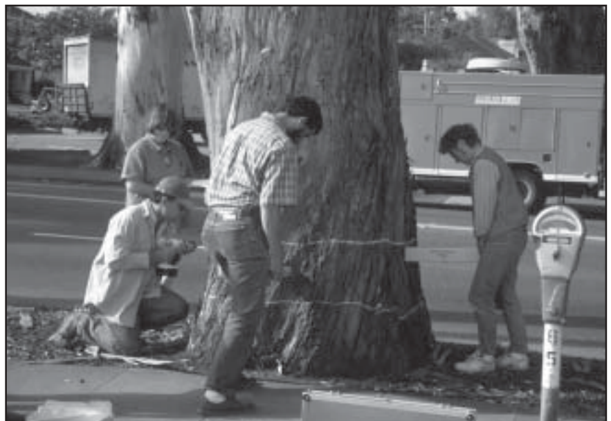
Figure 2. Wood decay being evaluated by research team members using the Resistograph (M300) and the portable drill. Four drill operators provided decay assessments at 3 sites on each tree, while 2 Resistograph units were used.

on 1 side of the template were a Resistograph (R1) and 2 drill measurements (D1 and D2). At the same height,