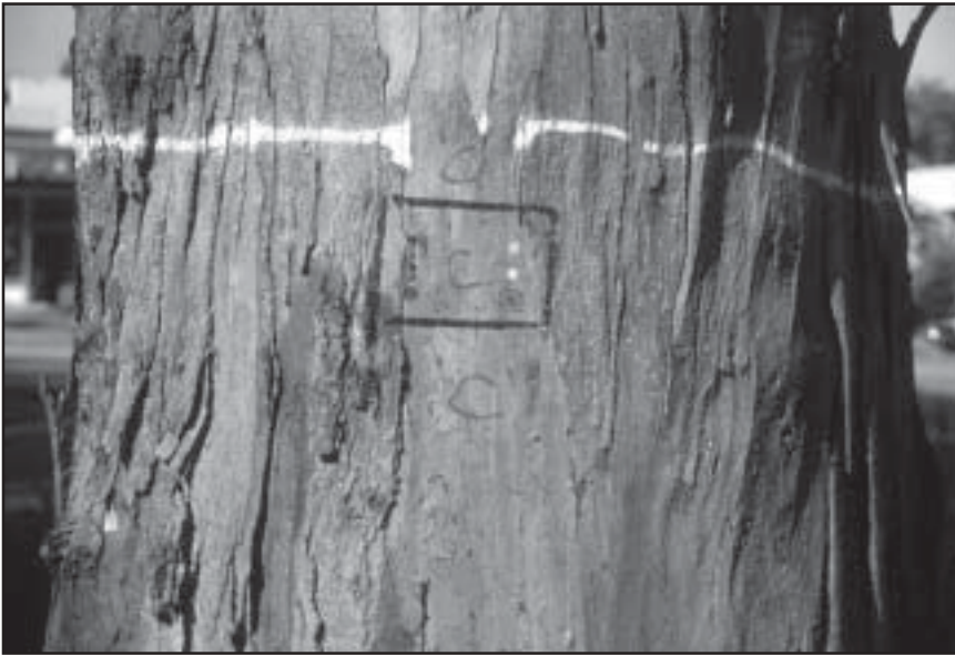
Figure 3. A template was used on all trees to consistently mark the location of Resistograph and drill measurements. Wood between measurement sites was sectioned and used for density analyses.

but 7.6 cm (3 in.) apart from these measurements, R2, D3, and D4 measurements were made in a parallel column. Three measurement sites were selected between 0.6 and 1.8 m (2 and 6 ft) aboveground on the trunk of each tree, for a total of 48 measurement sites on blue gum and 14 on elm. On 1 elm, only 2 template sites were accessible.