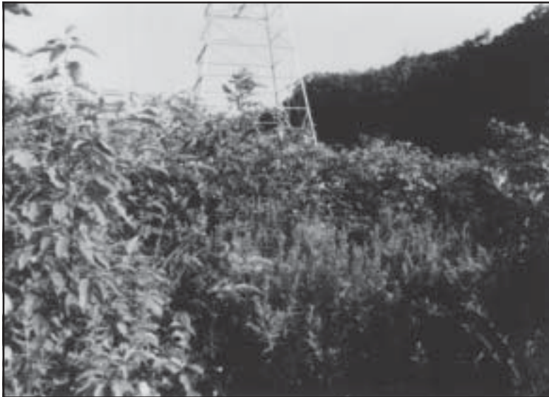
Figure 3. Handcutting unit HC-1, August 1, 1995. A tree-shrub cover type was on the wire zone. A patch of goldenrod and hay-scented fern occupied a small opening.

per unit) and species abundance (number of individuals per acre in each unit). Data were collected from 7 census counts distributed over the 1997 growing season to cover major flowering periods.