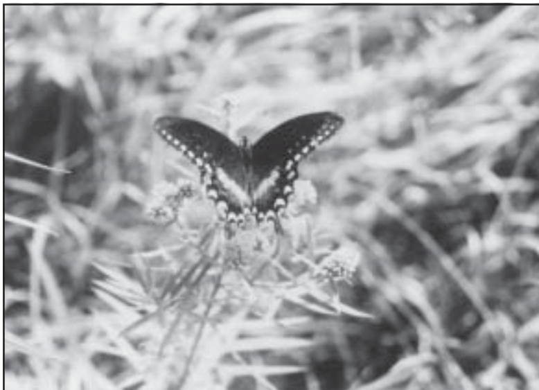
Figure 4. A spicebush swallowtail on narrowleaf goldenrod on a mowing plus herbicide spray unit, September 3, 1996. This butterfly species was present on the ROWs at all of the 7 census dates in 1997.

Use of herbicides to control tall-growing tree species on an electric transmission line right-of-way, located in the Allegheny Mountain Physiographic Region in central Pennsylvania, did not adversely affect butterfly species diversity and abundance in comparison with handcutting without herbicides. These conclusions confirmed earlier results from similar research in the Piedmont Physiographic Region in eastern