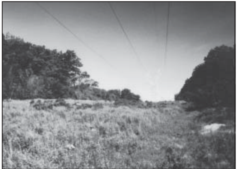
Figure 2. Mowing plus herbicide spray unit MH-3, June 2, 1998. A forb-grass cover type was being invaded by sweet fern. A shrub-forb type occupied the border zones.

The effect of ROW maintenance with herbicides to control target trees on the ROW butterfly population