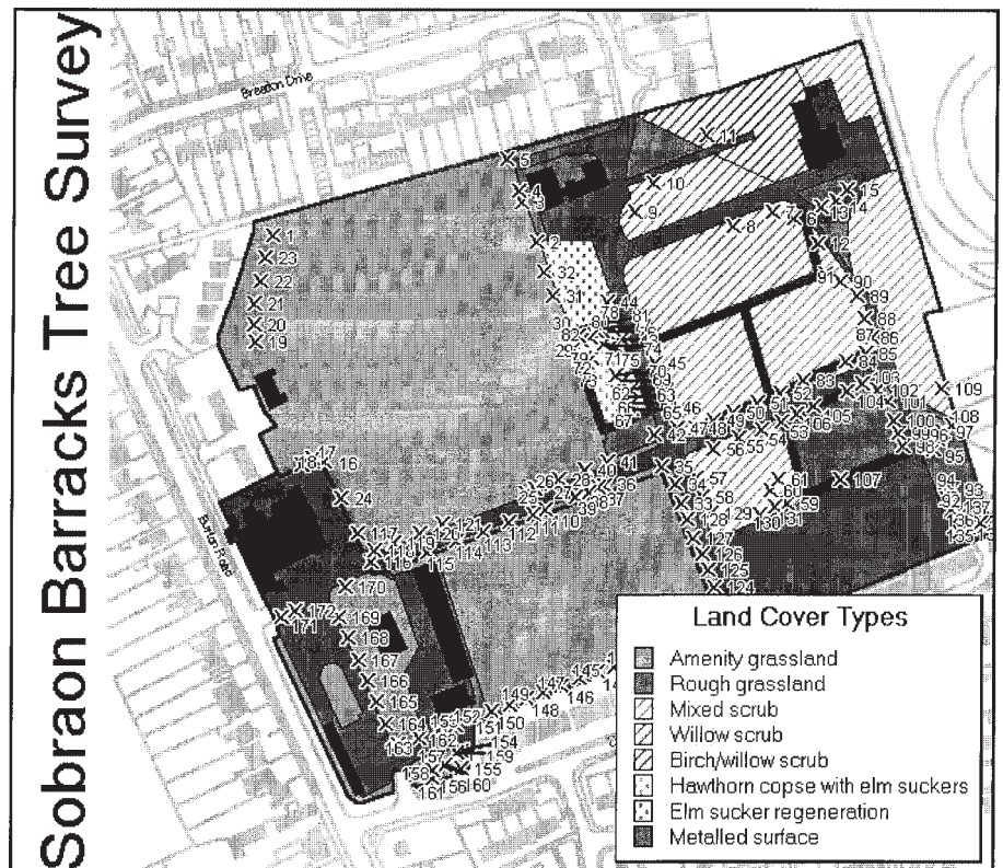
Figure 1. Tree locations and land cover types.

Global positioning systems allow rapid and accurate mapping of landscape features while the use of geographic information systems technology allows rapid access, processing, and updating of tree survey data. The use of this data in the field using a laptop computer should aid the professional tree surgeon in de-